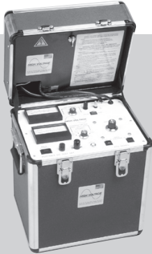
PTS-75 Model (0-75 kVdc, 10mA)

Two HV Portable DC Test Sets for the Price of One!