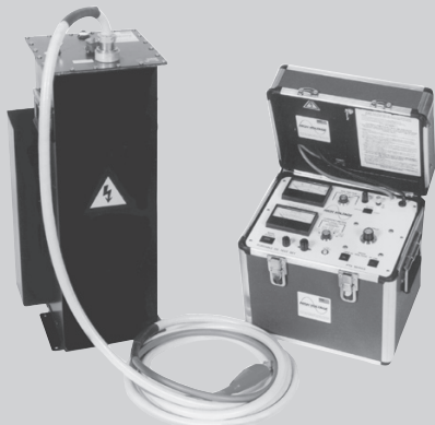
PTS-200 Model (0-200 kVdc, 5mA)