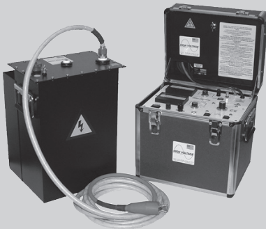
PTS-130 Model (0-130 kVdc, 10mA)